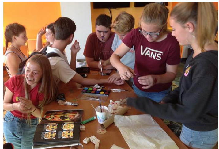
A Halloween program for teens at the Scotts Valley Branch.