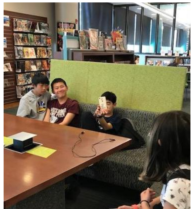
The Teen Zone in Palo Alto's Library

"If you are just looking to relax after a busy day at school, the Zone provides books, magazines, and audio that you can use to pass the time." - M